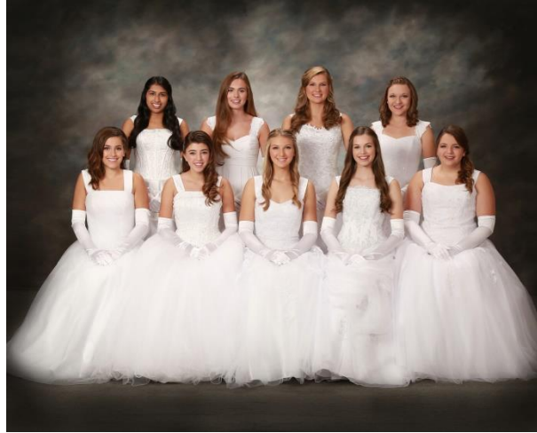
2016 Les Fleurettes Debutantes

The Thursday Club's Les Fleurettes Debutante Program has been an important part of the Club since 1951. It is a wonderful, fun bonding experience for high school girls and their mothers. The training received through the program includes personal development, etiquette, interview and public speaking skills, community and charitable service, and cultural enrichment. Upon completion of the program, the Debutantes are presented at an elegant, black-tie gala.